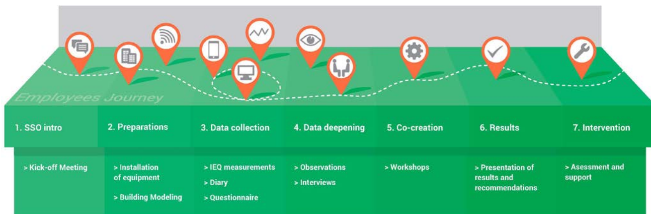
Figure 2. Stages of SSO study.

evant questions and obtain extra qualitative information to describe critical issues. The extent of observations depends on the space syntax relating to the size of the space analysed and the number of relevant points to observe, given that each space should be covered several times a day and different days of the week.