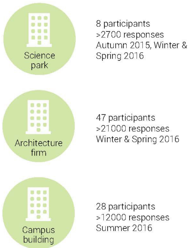
Figure 3. Pilot studies.

e.g. the required levels of concentration, stimulation or privacy.