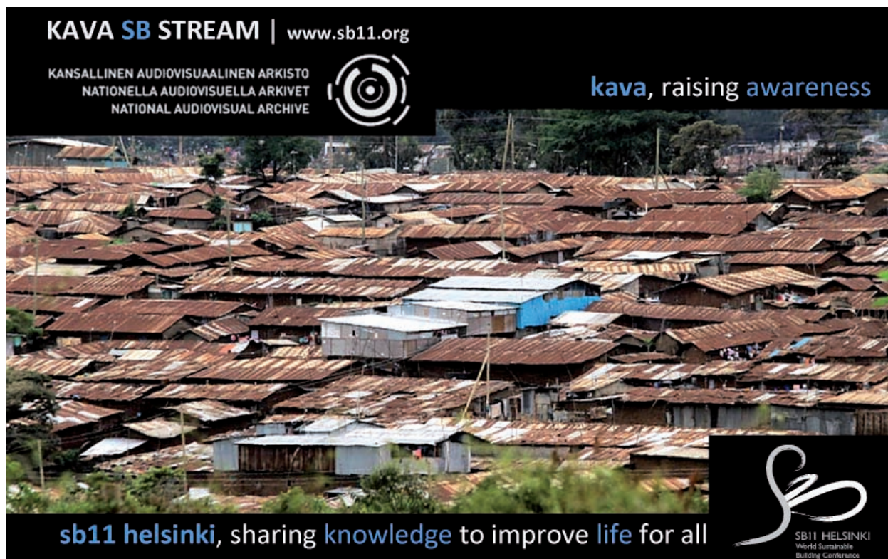
KAVA SB Stream advertising image.

To complement the scientific content of the conference and to raise awareness among a wider public, a Parallel Programme was designed that included a special SB film stream organized in collaboration with KAVA, the National Audiovisual Archive, and a seminar at Haaga-Helia University, very close to the conference venue at Messukeskus.